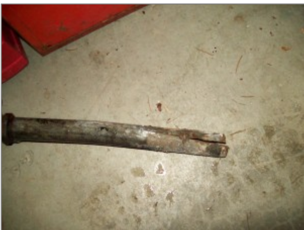
Cracked galvanised piping due to freezing