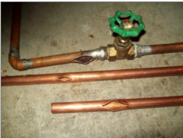
Burst copper piping due to freezing

Contact a reliable plumber to repair the burst or frozen pipe(s).