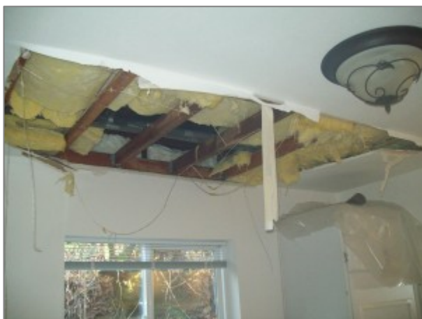
Partially collapsed ceiling

If water has been leaking through for some time and the ceilings are bulging - be careful, rooms may not be safe to enter. If safe, carefully punch a hole to let the water escape, and catch the water in buckets placed underneath. Again be careful in case the ceiling collapses. If in doubt do not touch the ceiling.