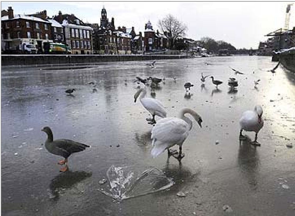
The frozen River Ouse in York

Brief thaw before temperatures plummet again