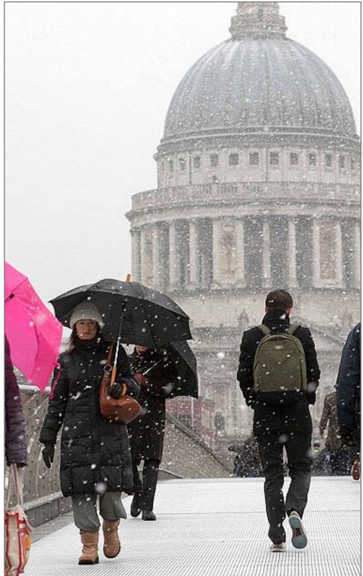
Commuters brave the snow near St Paul's in London

We are pleased to say that our major client centres are fully operational at this time and are appreciative of the dedication of colleagues some of whom have overcome adverse weather conditions to ensure we continue to provide a normal service.