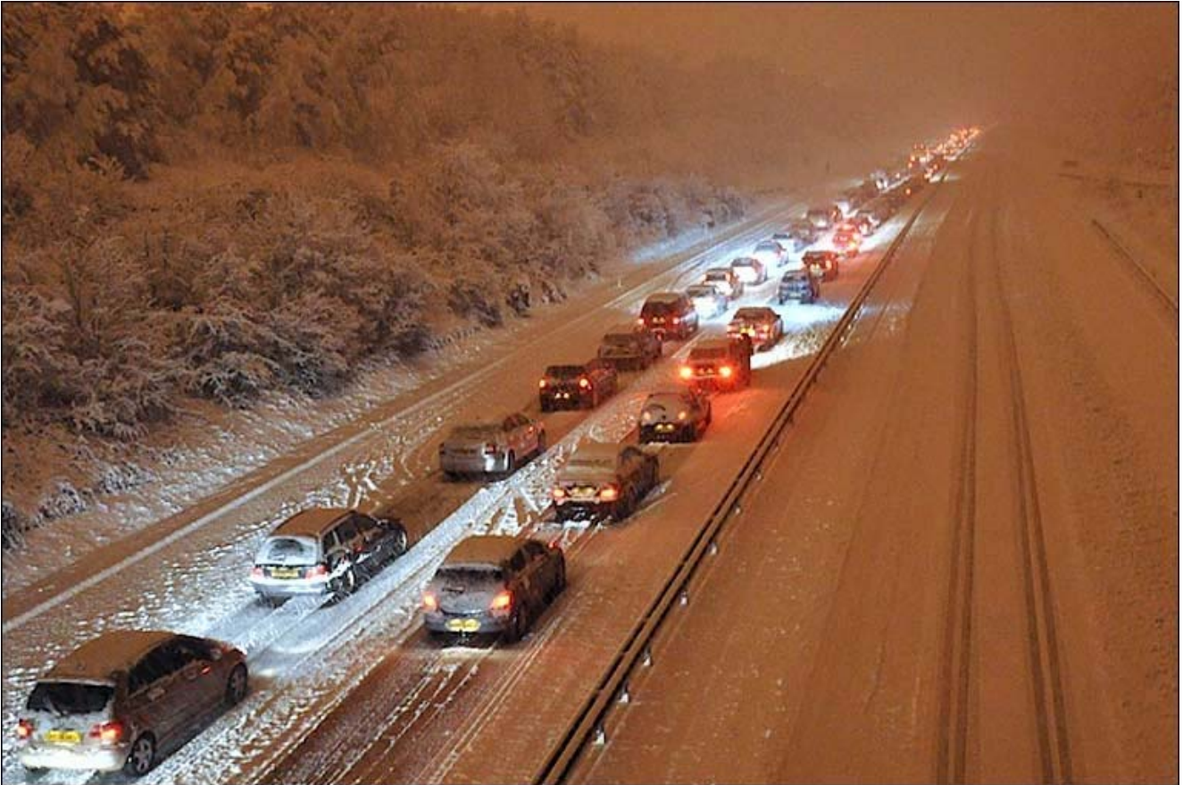
Traffic gridlocked on the A3M at Horndean, in Hampshire

The severe weather which has affected Scotland, northern England and parts of Wales has now moved south as Britain experiences its longest and most severe cold weather for three decades. The southern counties are currently worst affected. Throughout the country roads, schools and businesses are closed, and we have been advised that several insurance company offices are closed today, particularly in the south of England. The Met Office say there could be up to a foot and a half of snow in parts of the south east.