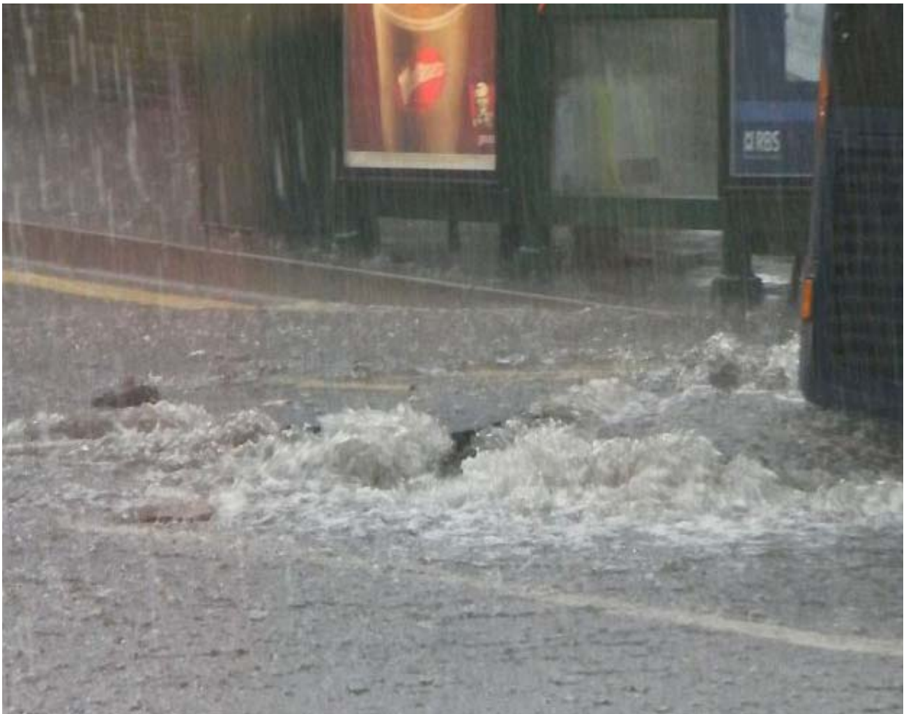
Water escaping from manhole as drains are unable to cope with volume of water in central Bournemouth